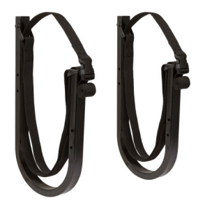
MG SUP Racks #12-0105

MG Free-Standing Brackets - Black (#32-5505) are available to allow you to move/remove the arms with a quick release locking pin.