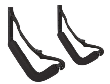
MG EZ & MG Big EZ Racks #12-0101 & #12-0102

MG Free-Standing Brackets - Black (#32-5505) are available to allow you to move/remove the arms with a quick release locking pin.